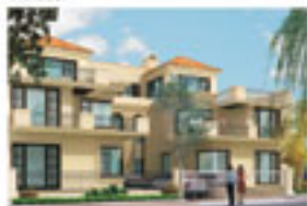
360 sq. yard