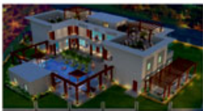
Club Pool View