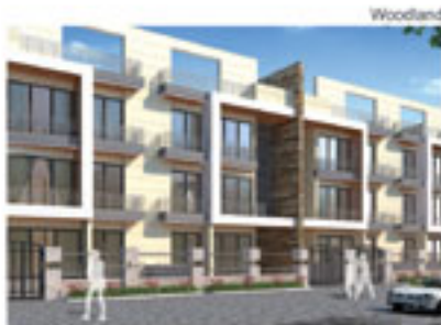
240 sq yard

Jindal Residency is a superb habitat to cater to your distinguished lifestyle. It presents independent floors in various sizes. Contemporary designing and stylish elegance are the benchmarks of these vastu compliant and well-ventilated residential units. Usher into a lifestyle refreshingly enthralling with the ideal setting for morning yoga, or walk across the dew soaked lawns. Celebrate evenings in the spacious rooms extended to the balcony. Further, you have exclusive children's park, playground and many such amenities to look up to.