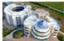
Delhi Public School