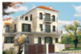
500 sq. yard