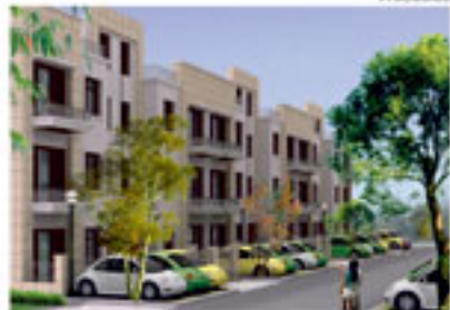
190 sq yard