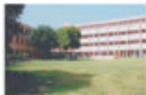
Hindu College of Engineering