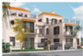
275 sq. yard