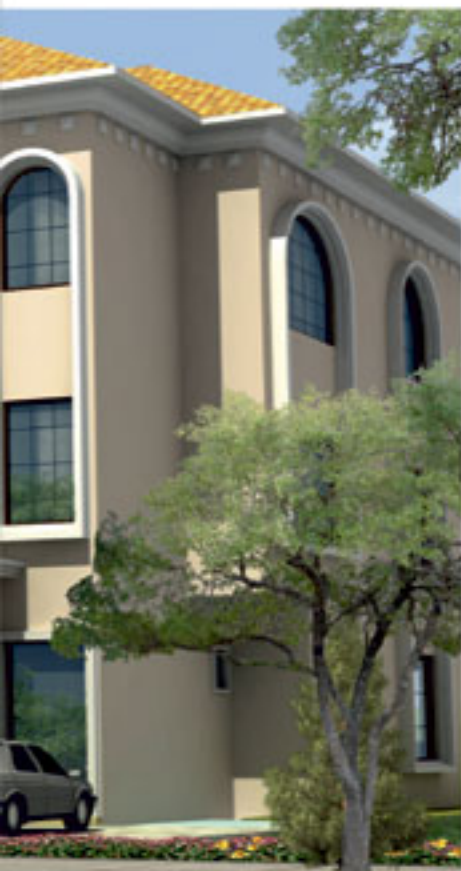
500 sq yard