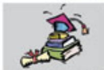
Proposed Rajiv Gandhi Educational City