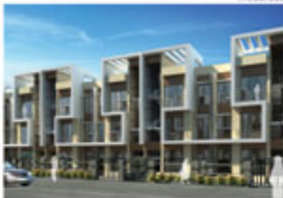
190 sq yard