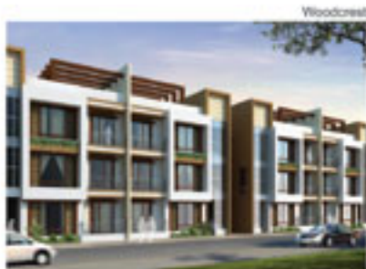
360 sq yard